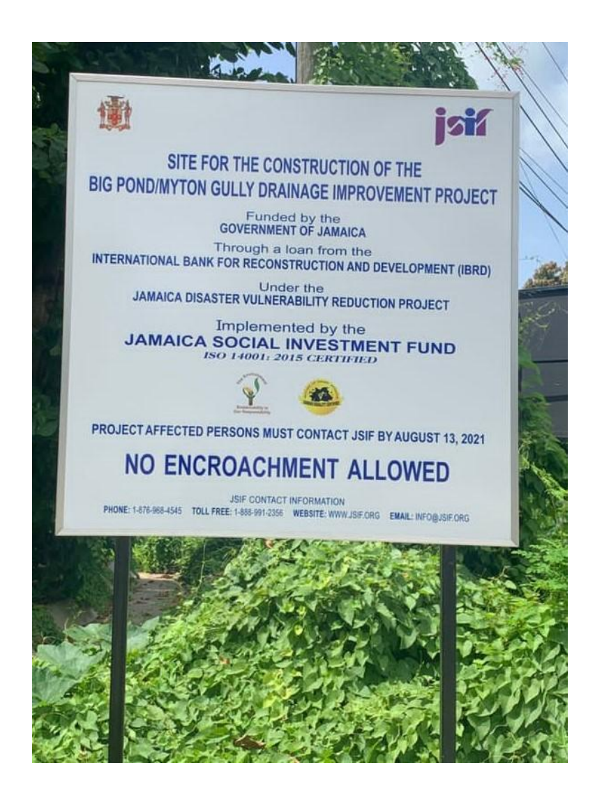
Figure 3: Project Sign with Cut-off Date

The sign above was used to ensure consistent information is being communicated to all affected persons. Additionally, the sign provided detailed contact information for persons who wish to contact JSIF directly.