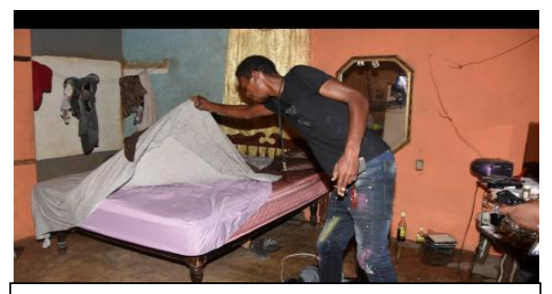
Resident shows how his home has been flooded due to the heavy rains caused by Tropical Storm Elsa. Source: Jamaica Star, July 6, 2021.

Resident in Bannister lifts her son to safety inside her home that was flooded during Tropical Storm Grace. Source: Daily Gleaner, August 18, 2021.