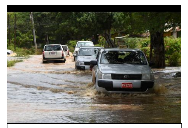
Taxi operators and private passenger vehicles navigating the flooded streets in the Big Pond community.

The Big Pond area was in the past also emptied by an earthen drain which discharged into the Myton Gully. According to anecdotal information and media reports<sup>3</sup>, the constant build-up (dumping) of the drainage passage to facilitate construction of residential buildings and access roads has severely obstructed this waterway. Consequently, the area has become more susceptible to flooding, especially during major storms.