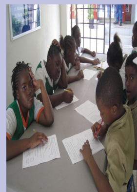
Homework classes at the Child Resiliency Programme.