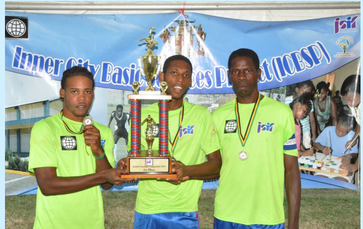
Shelter Rock display the winning trophy at the ICBSP Inter-Community Football Competition