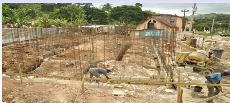
Construction underway for the Golden Spring Health Center in West Rural St. Andrew .

The total Project cost will cost of J$ 39,740,085.24 with the amount requested from JSIF being J$ 35,407,003.85. The total community contribution in kind is J $4,333,081.39.