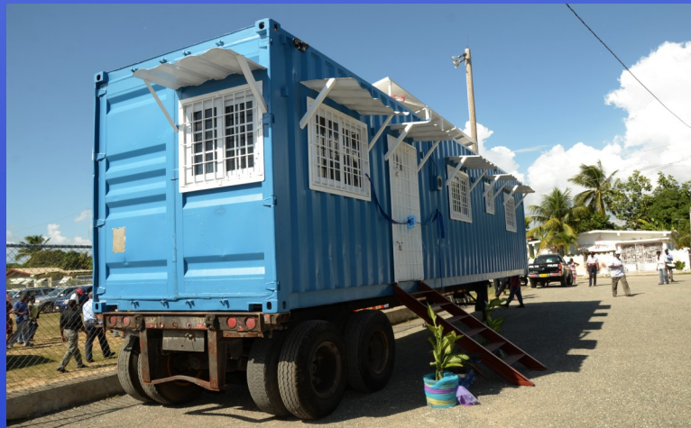
Fully equipped community and dispute resolution center in March Pen St. Catherine.

The island's security and dispute resolution efforts were bolstered by the provision of Four (4) Mobile Security & Dispute Resolution Centers. They formed part of the World Bank funded Inner City Basic Services Project being implemented by the JSIF. In the immediate future, the Centers will serve 9,702 residents across St. Catherine. These retrofitted 40ft intermodal shipping containers, were undertaken at a cost of JMD 25,858,028.50. The design of the containers incorporates environmentally-friendly and self-sustaining features, including a solar system that would supplement electrical power and a self-contained sewage system. The centers will be used for administrative purposes with a new computer. The centers also have a kitchen area, a bathroom and two sets of bunk beds. The wheels attached to the centers allow for easy movement from place to place. The units also feature solar panels that allow for reduced electricity usage;