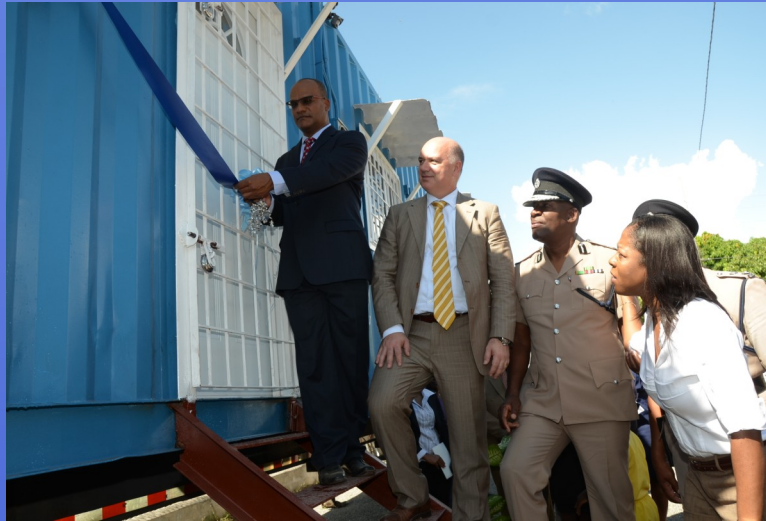
Hon Peter Bunting Minister of National Security cuts the ribbon at the handing over ceremony.